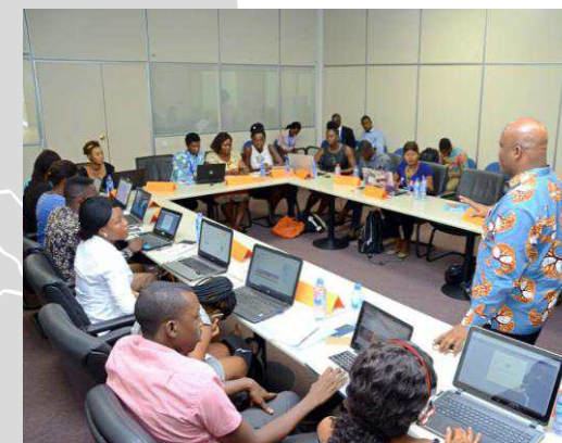
Training on designing a public media campaign, Accra